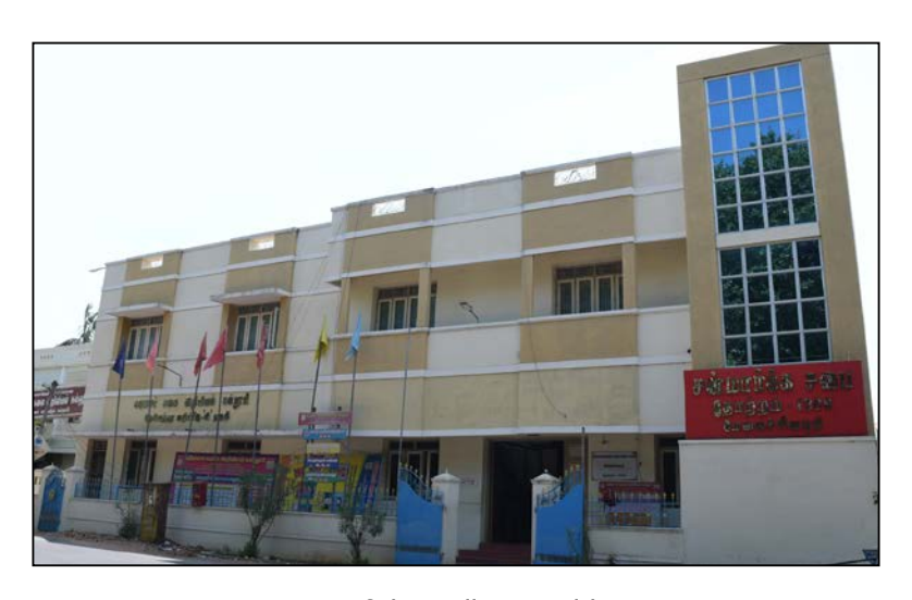
View of the College Building